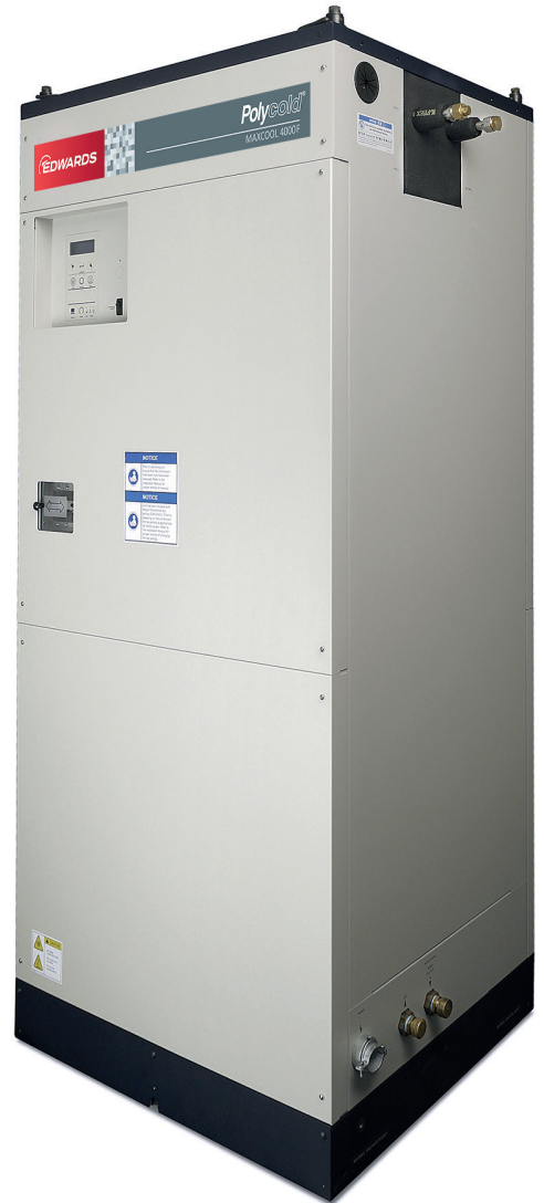
The Polycold® MaxCool 2500L Cryochiller is compliant with European Application Refrigerants (EC 1005/2009), the Montreal Protocol and the US EPA SNAP

MaxCool Cryochillers are the most cost-effective upgrade that you can add to any diffusion-pumped, turbo-pumped, or helium-cryopumped system.